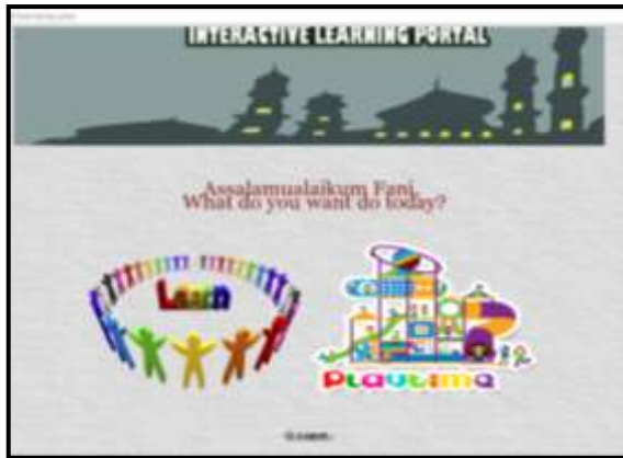
Successfully Login Student Feature