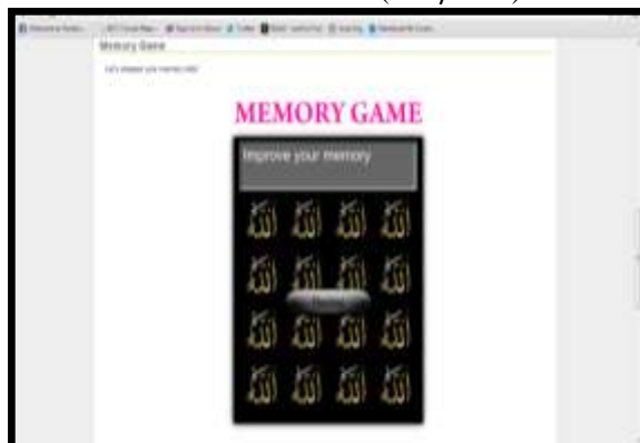
Playtime Feature (Memory Game)