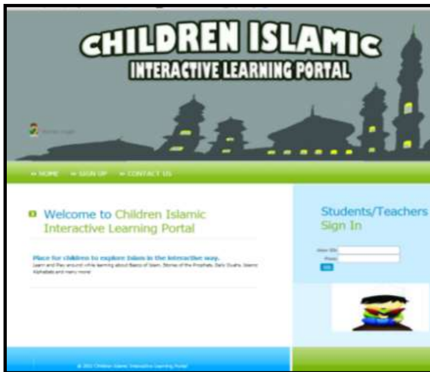
Figure 2: Main page of Children Islamic Interactive Learning Portal System

The Home Page view and the administrator link to login with the red oval shape sign. The administrator needs to fill in their ID number and password that have been given earlier when they have been responsible to manage the portal system. The previous page directs to the administrator successfully login page. There are several functions that can be exploiting by the administrator. The grand access for the admin to manipulate the data for the administrator can update their information in this section. The function that the administrator can perform to the user. For this portal, the users consist of teachers and students. As the administrator, they can view all the users' information, edit the teachers and students information as well the access to delete. The function that the administrator can view is the log of every user access to which page, time and date. The data log can also be deleted. The login page is for the teacher and the direct page if the teacher successfully login to the portal. The function that the authorized teacher can perform is to view all of the student information as well to update the data. Furthermore, teacher also has the access to upload learning material for the student.