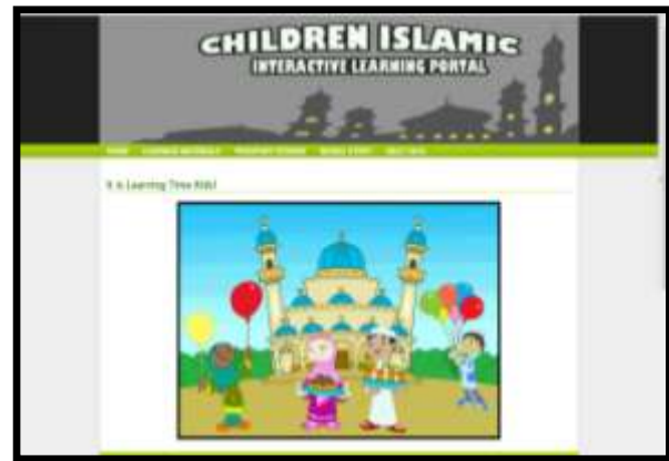
Learn Time Feature (Home)