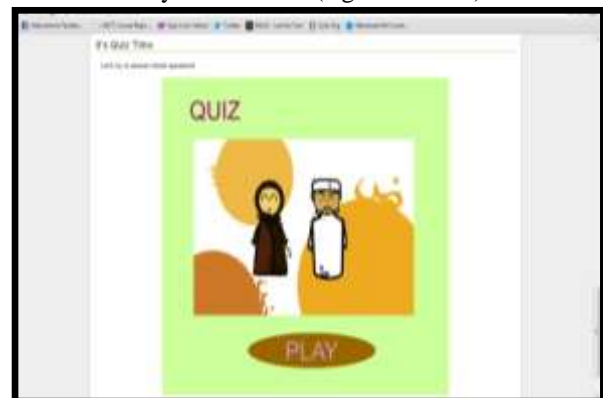
Playtime Feature (Quiz)