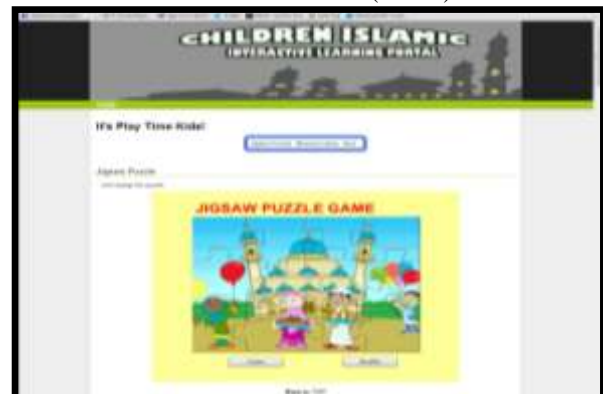
Playtime Feature (Jigsaw Puzzle)