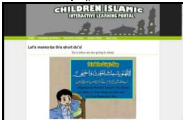
Learn Time Feature (Daily Du'a)