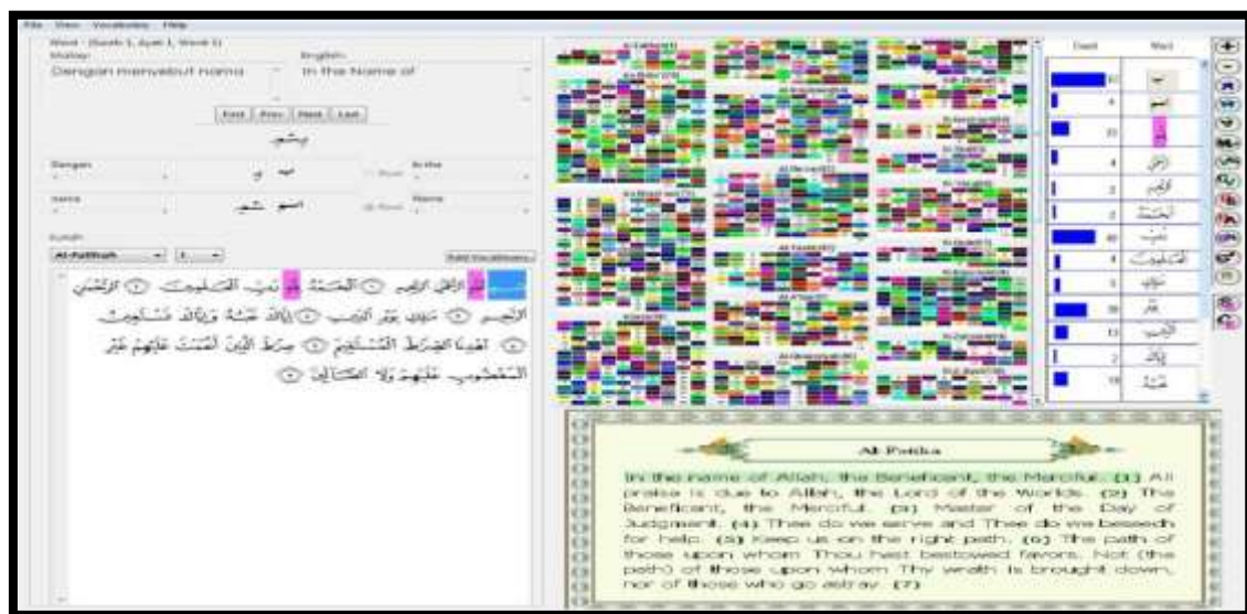
Figure 3: Scatter plot visualization of Qur'anic

In response to question 2, an improved interface was developed for the purpose of learning the Qur'anic words. Figure 3 shows the new interface. The parallel plot has been replaced by a similar plot to the scatter plot in the Graph Pane section. Here the users are shown each word within a particular sura. Each time a word in the Sura Pane is clicked, all of those words in that particular sura and in all other sura are highlighted. At the same time the word count is displayed in the next column. In the visualization interface users are able to learn words in the Qur'anic verse. The scatter plot visualization of the word count, word position and percentage information are to support the learning process. Users for example can start to explore the more frequent words which can be found easily via the visualization plot. The information of the word frequency can easily attract the visual memory compared to list of statement written in text form. They are able to strategies their learning by starting to learn the frequently occurring words shown through the visualization plot. New words can be added to their personal vocabulary list.